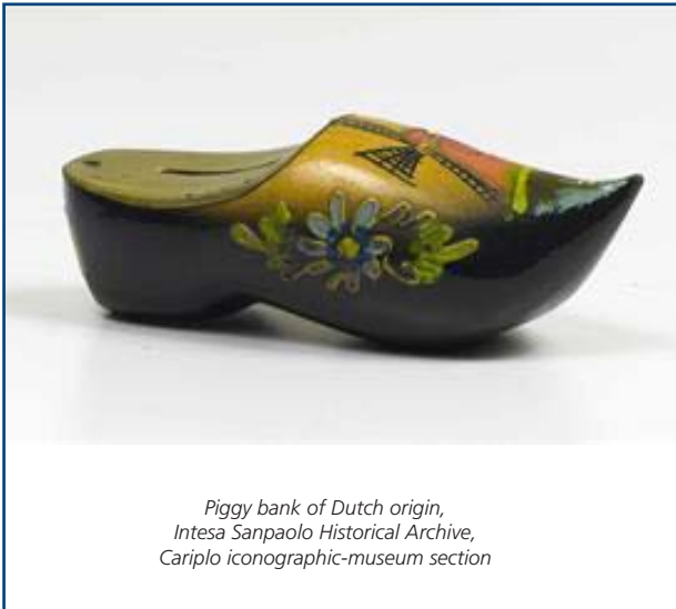
Piggy bank of Dutch origin, Intesa Sanpaolo Historical Archive, Cariplo iconographic-museum section