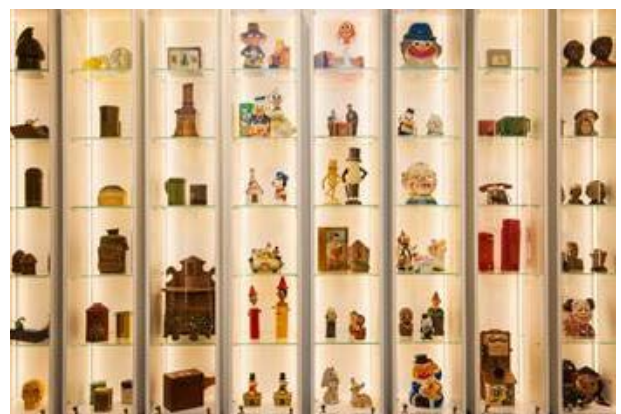
Historical piggy bank collection, Savings Museum (Turin)

Finally, some Intesa Sanpaolo branches in Vicenza, Bologna and Palermo welcomed the children of customers and employees to give them an informative and entertaining experience at the bank. A tour around educational stations, conducted by educators and teachers, focused on robotics and electronics and especially coding, computer programming that animates images, sounds and games through the creation of codes.