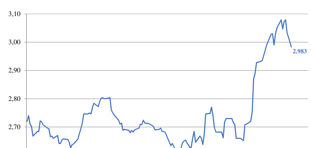
Chart - price of the savings shares in the last six months