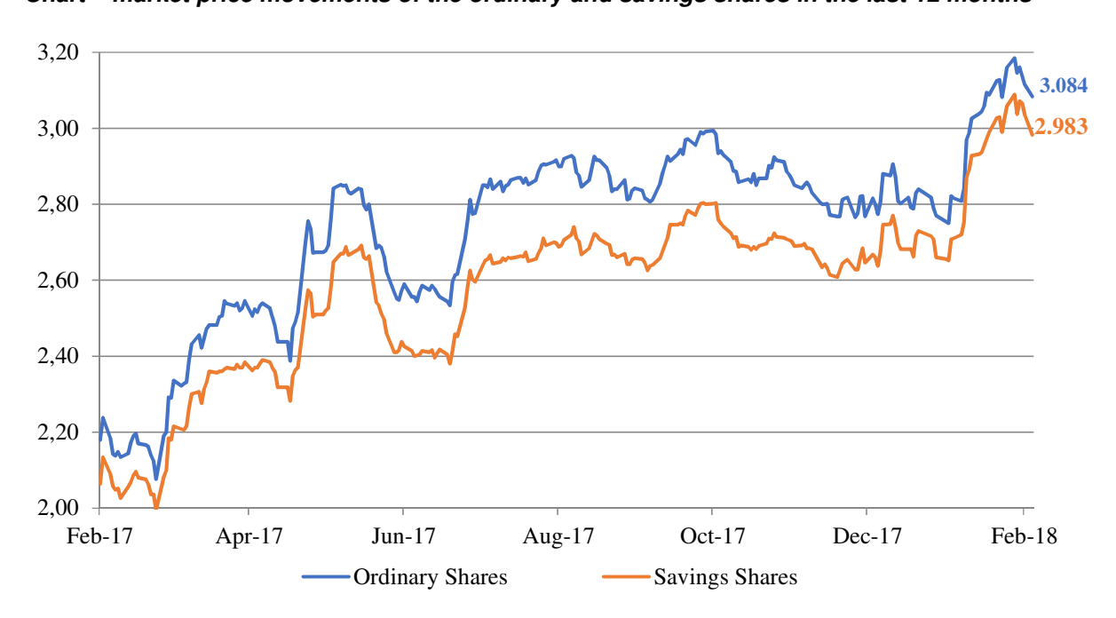
Chart - market price movements of the ordinary and savings shares in the last 12 months

The following chart shows the movements of the market prices of the shares belonging to each class of shares with reference to 5 February 2018: